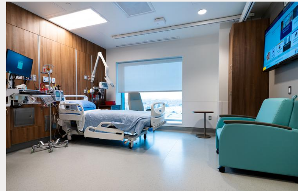
“Medical Surgical inpatient Unit” Recovery Room