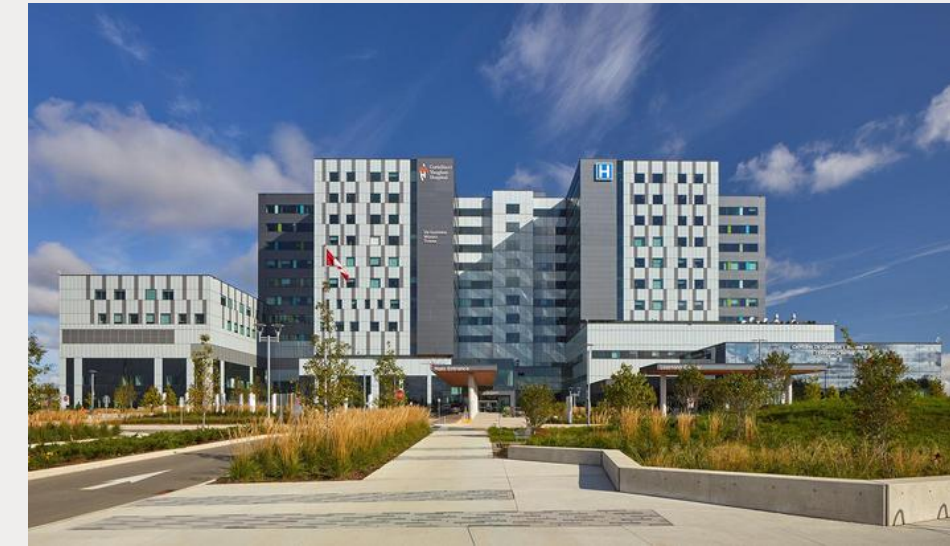
Cortellucci Vaughan Hospital

EVERYONE HAS BEEN AFFECTED BY CANCER IN ONE WAY OR ANOTHER. WE HOPE YOU HAVE THE CHANCE TO SUPPORT OUR EVENTS THROUGH A DONATION, SPONSORSHIP, AND/OR PARTICIPATION. IF YOU HAVE ANY QUESTIONS, DO NOT HESITATE TO CONTACT US.