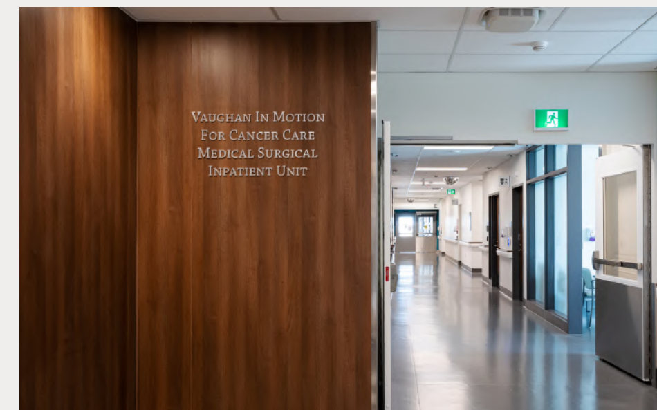
Vaughan in Motion Funds a $1,000,000 Gift to the “Medical Surgical inpatient Unit”.